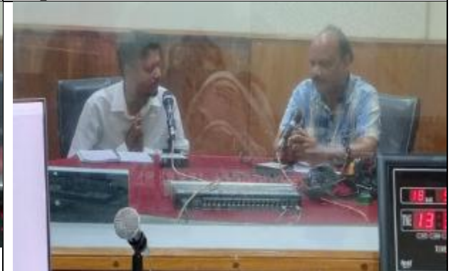
Radio Talk on seed production technology of greengram