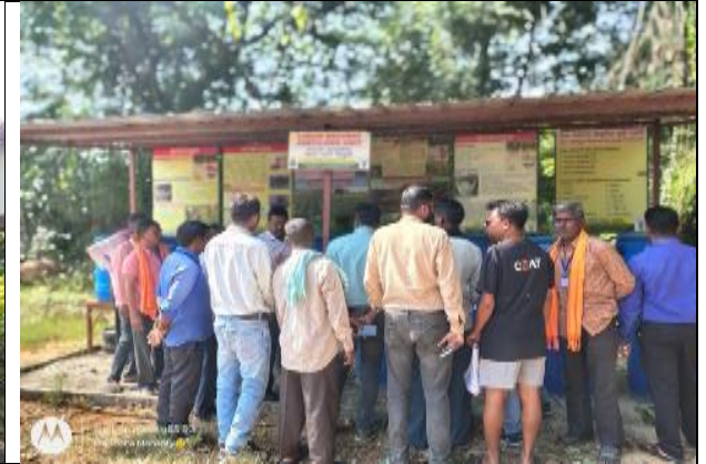
Farmers from Chattisgarh Agri. Dept. on Exposure visit