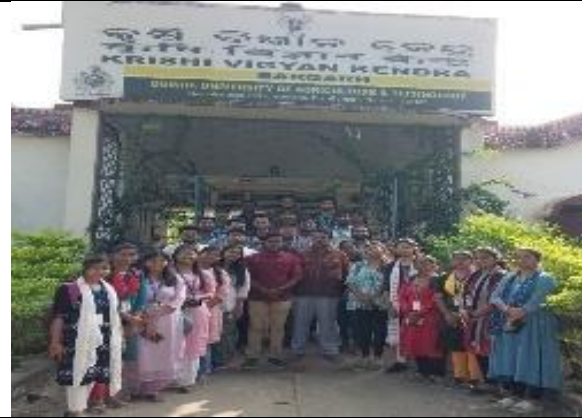
Students from CA of Bhubaneswar & Cuttack visited under KUS