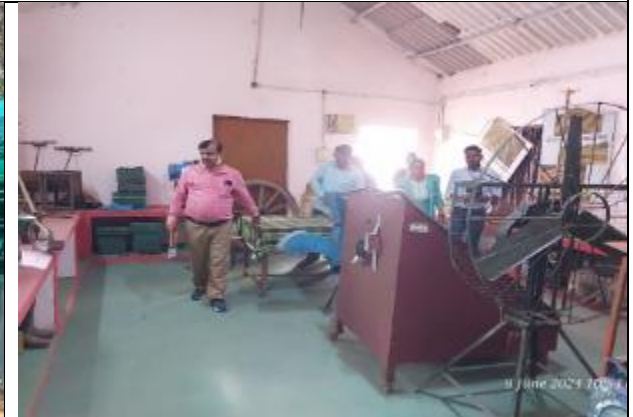
Visit of Hon'ble DEE, OUAT