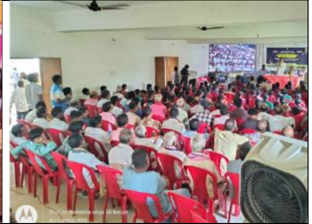
Dhan Dhanya Krishi Yojana 2025 Graced by Hon'ble MP, Bargarh