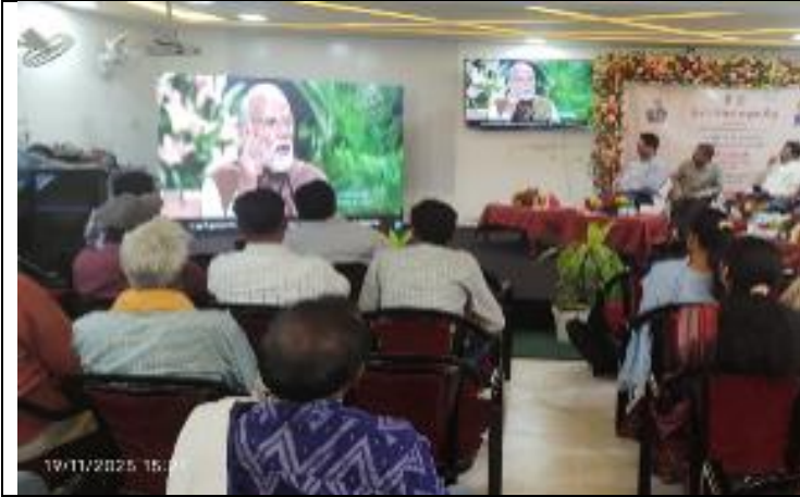
PM KISSAN SAMMAN NIDHI PROGRAMME 2025