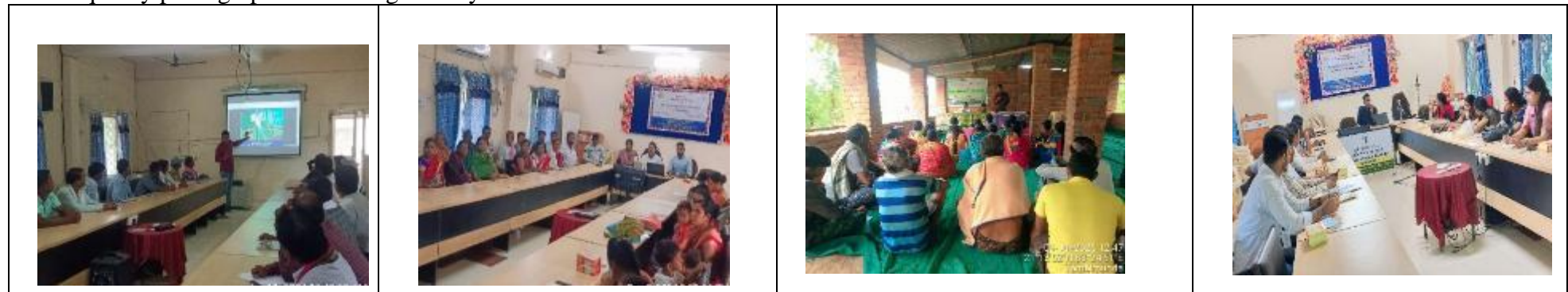
Good quality photographs of training activity: