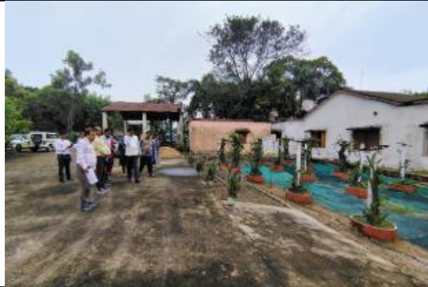
Visit to Dragon Unit