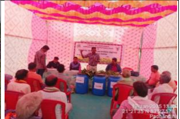
Training on Natural Farming