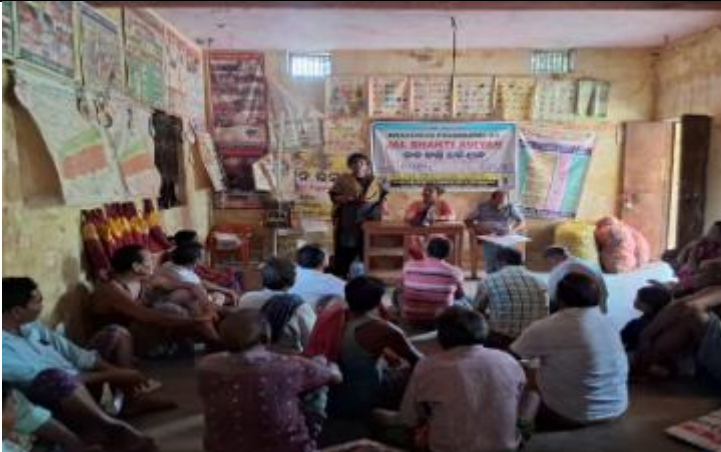
Jal Shakti Abhijan