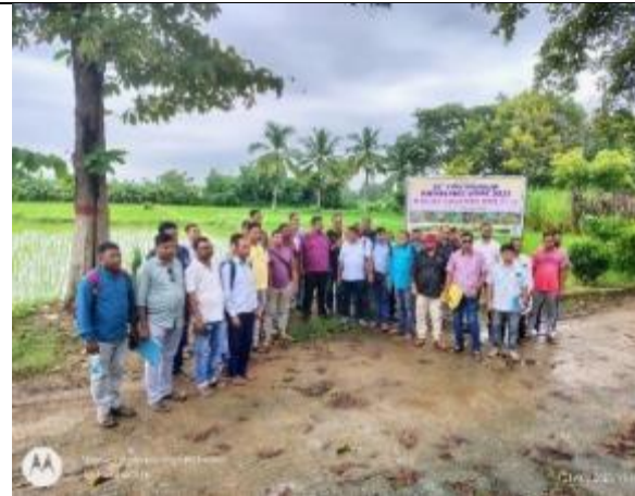
Exposure visit of farmers