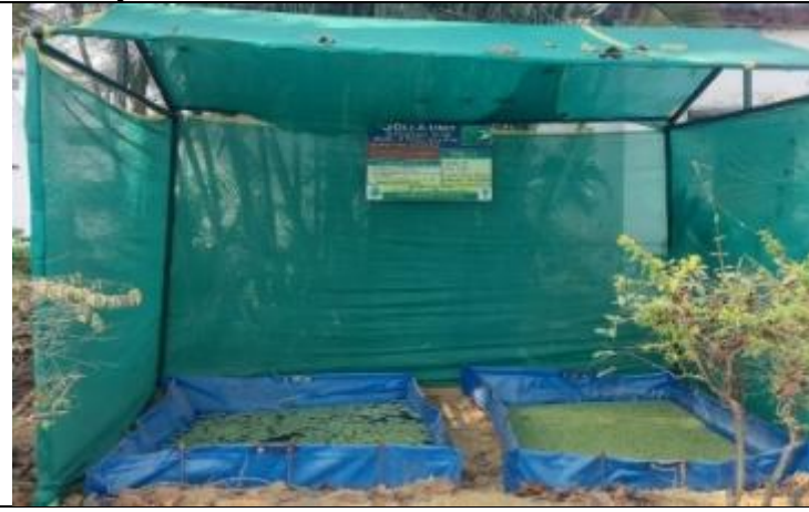
Azolla production unit