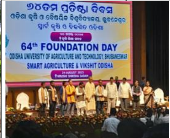
OUAT foundation Day