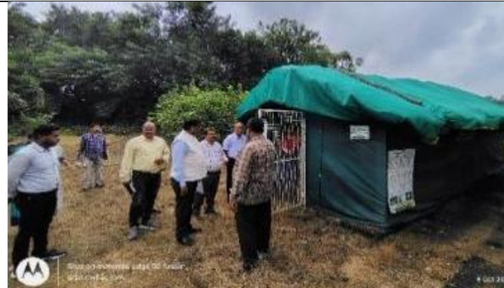
Visit to Mushroom production Unit