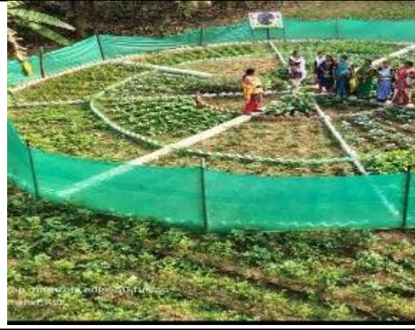
Nutritional Garden Unit