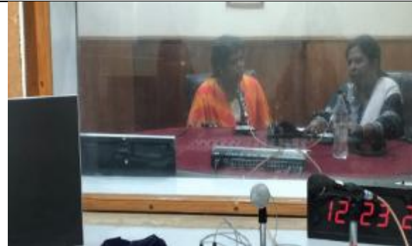
Radio Talk on value added products of Fingermillet