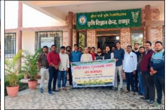
Exposure visit to KVK, Raipur