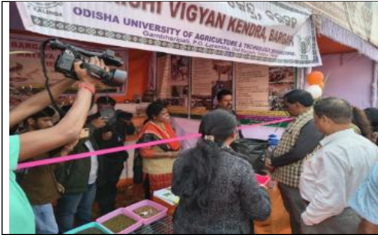
Dist. Level Mastyua O prani Sampad Mela