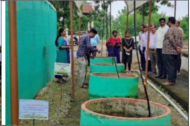
Visit of Hon'ble Vice Chancellor, Dean Research, Dean Ext. Education, OUAT