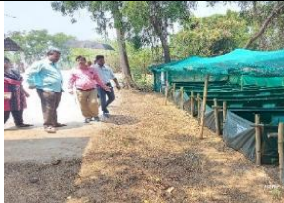
Visit of Hon'ble DEE, OUAT