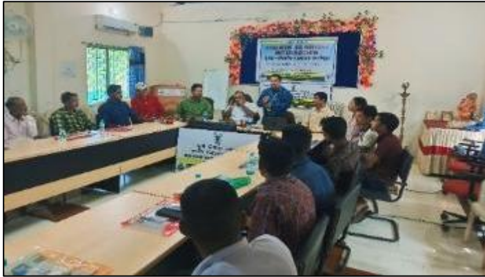
Farmer- Scientist Interaction