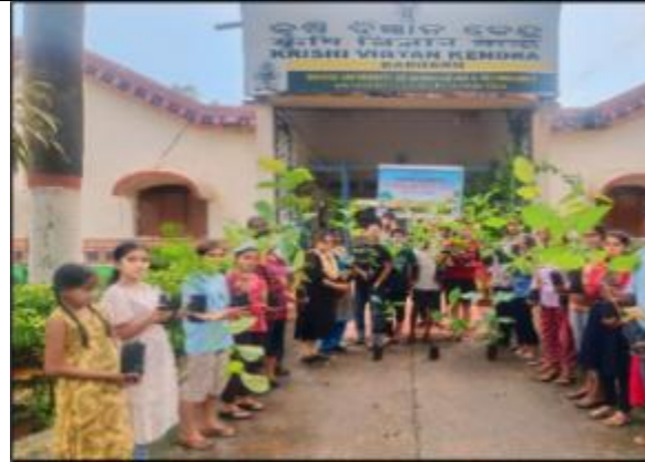
Celebration of Vanamahotsav week