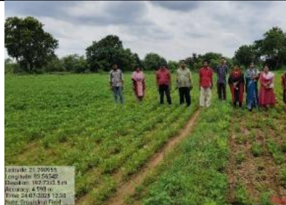
Joint Diagnostic field visit with CDAO, Bargarh