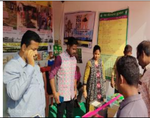
Dist. Level farm mechanisation fair