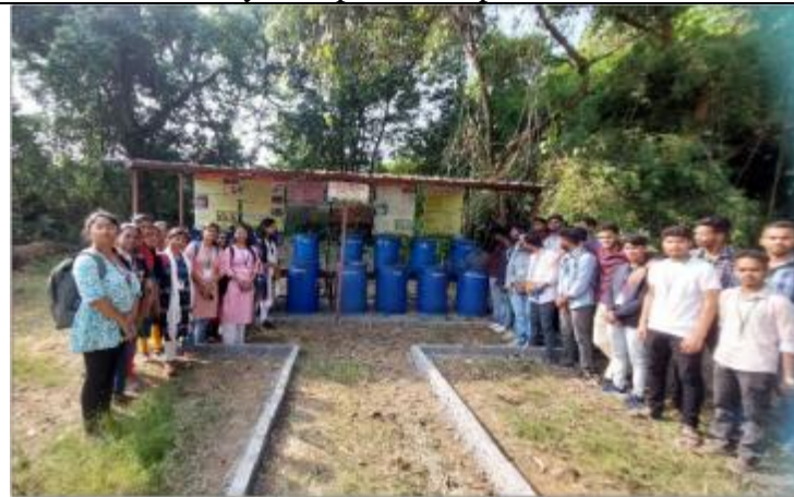
Exposure visit of UG Agriculture students