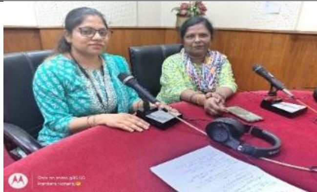
Radio Talk on protected cultivation