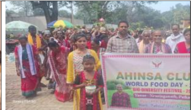
Celebration of World Food Day