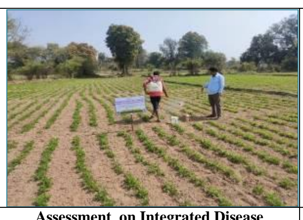
Assessment on Integrated Disease Management practices for Pea Nut Bud Necrosis Disease in Rabi Groundnut