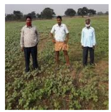
Field visit of Greengram at pod development stage, Village- patrapalli, Block-Bhatli, Bargarh, Odisha