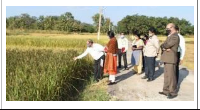
Hon'ble Vice-Chancellor & Dean, Extension Education, OUAT, BBSR