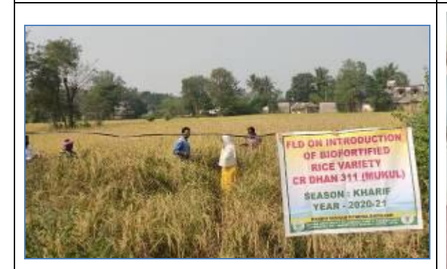
Introduction of Biofortified Rice variety CR Dhan 311 in transplanted irrigated Medium land