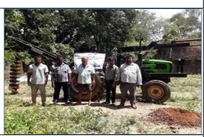
Demonstration of tractor operated post hole digger.