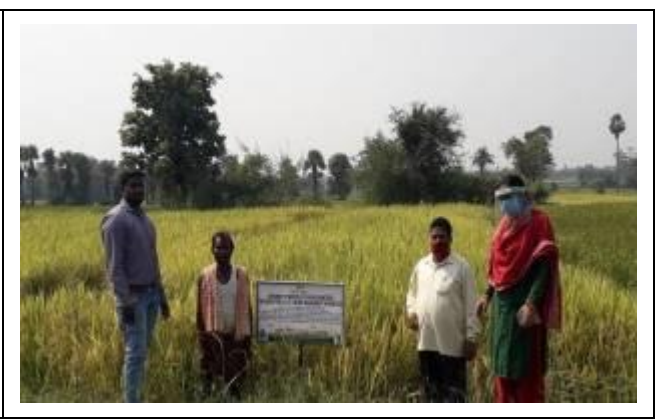
Assessment of Novel insecticide Triflumesopyrim 10.6 SC for BPH management in Kharif rice.