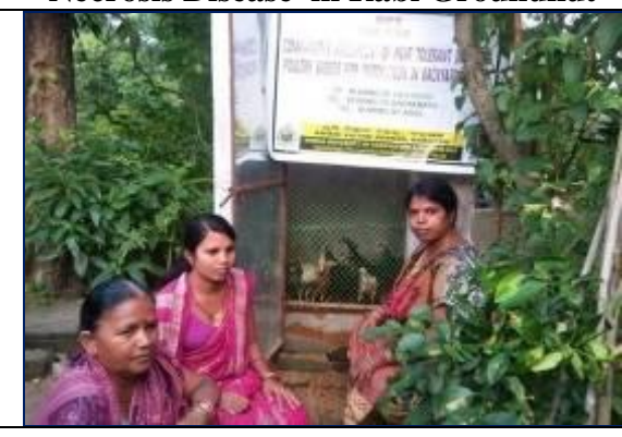
Comparative Assessment of Heat tolerant improved poultry breeds for production in Backyard system