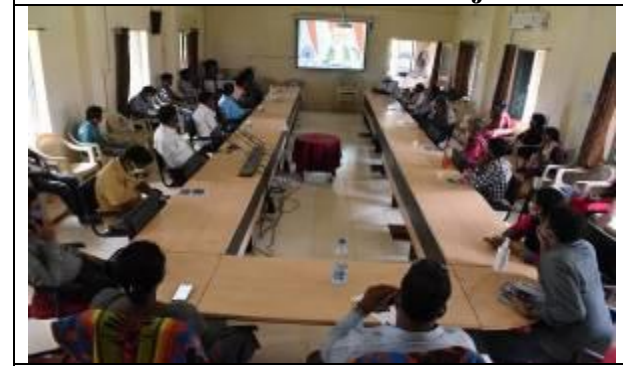
Hon'ble PM to launch financing facility under agriculture infrastructure fund