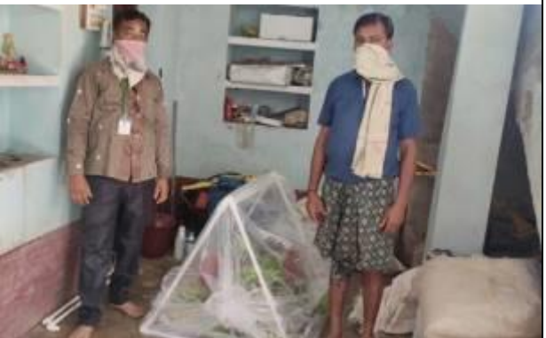
Demonstration of Low cost Ripening Chamber in Banana