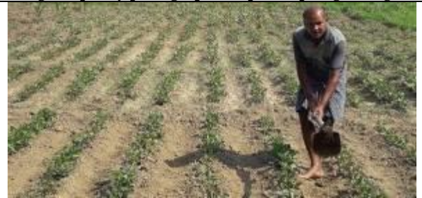
Greengram earthing up at Village- Kusumuda Block-Ambabhona, Bargarh, Odisha

g. Sequential good quality photographs (as per crop stages i.e. growth & development)