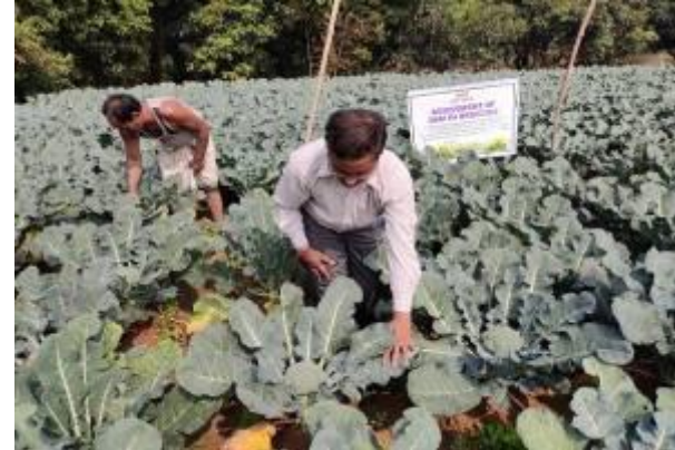
Assessment of INM of Broccoli in Rabi season.