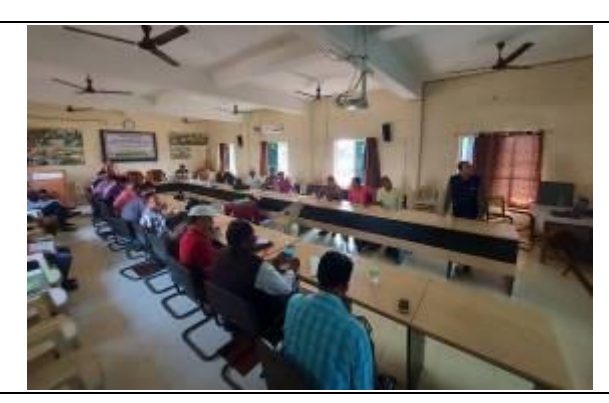
INSECTICIDE MANAGEMENT FOR INSECTICIDE DEALERS